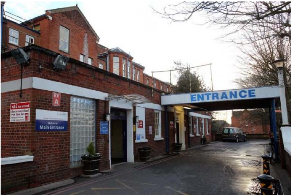
Whipps Cross Hospital. Leytonstone. (14/1/2013)